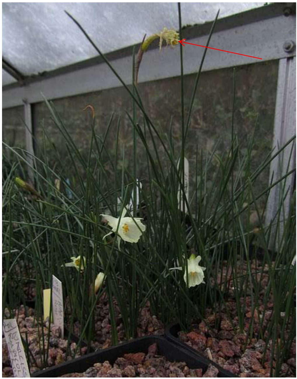
Narcissus cantabricus foliosus

Another interesting observation resulting from the cold weather can be seen in this pot of Narcissus cantabricus foliosus. Look at what short stems, all the flowers that are just opening have then compare those to the one that opened some weeks ago and has now faded – its stem is more than twice as tall. I must say I prefer the short stem version but it is difficult to achieve this in our changeable winter conditions.