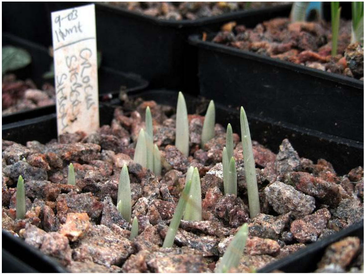
Crocus sieberi sieberi

These Narcissus were all lying flat for most of the last few weeks now they have pulled themselves upright to display their flowers.