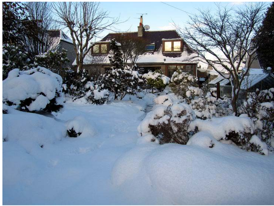
Back of house

The scene at the front of our house shows the pile of snow that we have built as we try and keep an access to get our wee car out. If you compare the snow on the roof with the picture below of the southern facing back of the house you can see that even though the sun does not climb high it does melt the snow from the areas of the roof that it strikes.