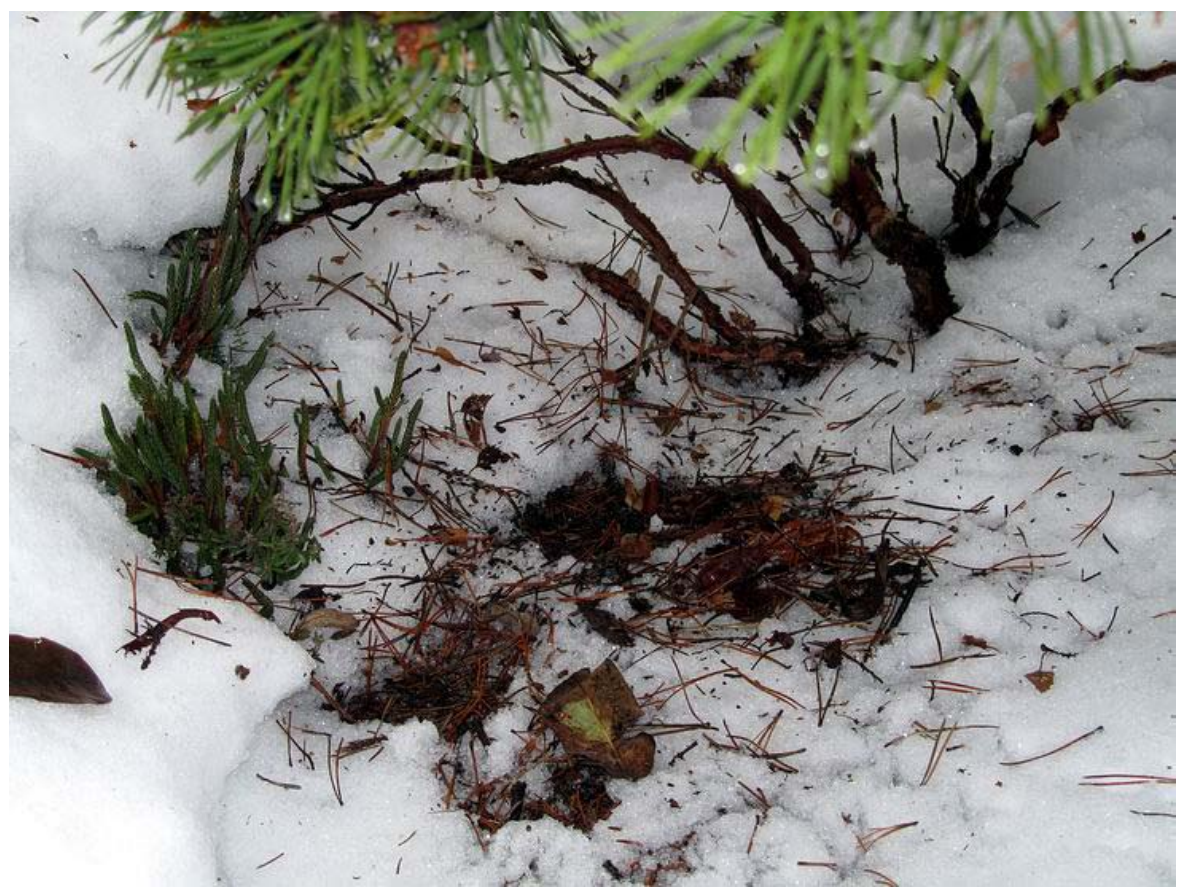
Under Pine tree

We were a bit worried that the pine tree fromwhich I removed the lower branches earlier this year might not be so useful to the birds as a shelter. I am pleased that there is still evidence that some birds do roost in the dense areas towards its top and the open area below, because of the much reduced covering of snow, now provides a good foraging area. I planted a number of bulbs in this recently exposed area including some Narcissus romieuxii types: I am watching with interest to see if they will grow and flower there. The lower branches of the pine used to cover at least the top two courses of the rock wall but since I opened it up I also popped a few Narcissus bulbs in between the rocks.